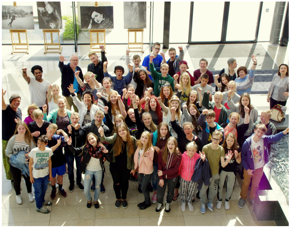
Full-group, Wejherowo-exchange in Poland

and qualitative research data indicate that the investigated international youth exchanges have a significant