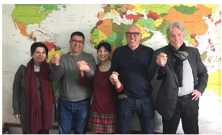
DfP board at A.C.T.O.R's office, in Bucharest