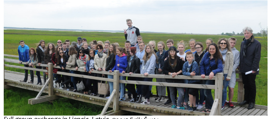
Full-group, exchange in Liepaja. Latvia

They show a positive devopment at participants, which is above the one found at a control-group, who didn't go anywhere.